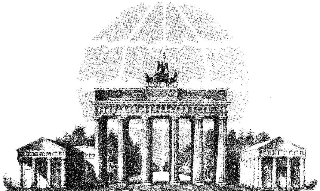
Das Brandenburger Thor.